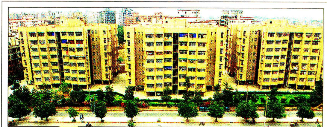
DDA has been acquiring large tracts of land for housing.

As per the Master Plan of Delhi 2021, zones A to H are urban areas and zones J to P (I and II) are earmarked as urban extension areas or rural areas.